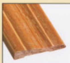
356 COLONIAL CASING 7/16" x 2-1/4"