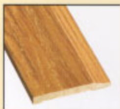
624 COLONIAL BASE 3/8" x 2-3/4"