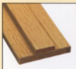
STOP APPLIED JAMB Standard and Custom Sizes Available