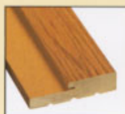
SINGLE RABBETED JAMB Various Sizes Available