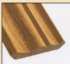
51 CROWN 1/2" x 3-1/8"