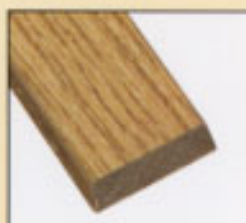
DOOR STOP 3/8" x 1-1/4" Other Sizes Available

1-CROWN Softens and decorates the meeting of wall and ceiling.