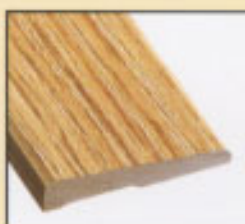
3002 BEVEL CASING 7/16" x 2-1/4"