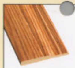
3140 VINYL BASE 3/8" x 3-1/4"