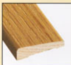
3000 BEVEL CASING 7/16" x 1-7/16"