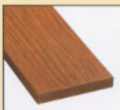
545 FLAT STOCK 1x1 - 1x10